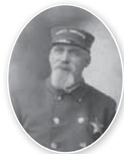
Grandpa Sanitary Inspector