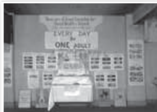
Hamilton Dept. of Health, early 1930s

The National Nutrition Committee, later named the Canadian Council on Nutrition, was established during the Depression to develop a scientific nutritional standard to help ensure that families on relief could be adequately nourished with the minimal money they received. Before the Council issued Canada’s first dietary standards in 1939, the Dominion Council on Health noted in 1937 that, “at present, they are very resentful and claim they cannot possibly live on account of