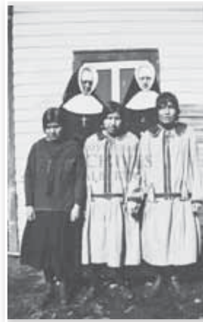
Sœurs de l'Assomption de la Sainte-Vierge, Provincial Archives of Alberta, A17205

Provincial health authorities continued to express alarm about the threat of tuberculosis spreading to non-Indigenous populations while the federal government still did not act. Recent