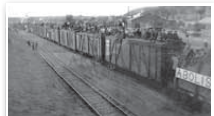
On to Ottawa Trek, Medicine Hat, AB, 1935

certification, and training standards in the public health field were strengthened, especially for nurses and inspectors. When the economy gradually began to recover in the latter half of the decade, the Dominion government, the Dominion Council of Health and the Canadian Public Health Association also began expanding the specialization of interests and activities.