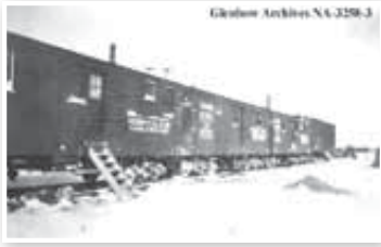
Hospital cars on Hudson's Bay Company Line picked up typhoid patients, 1929

not pasteurized. There was wide variation in milk control legislation across the country and if referenced specifically, pasteurization was left to local health boards to enforce,