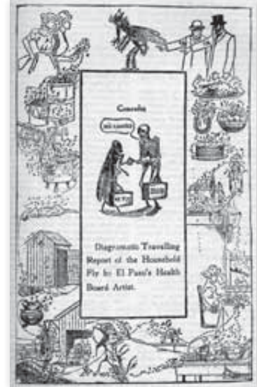
Public Health Journal, 2 (June 1911)