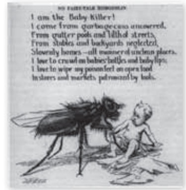
Newark Evening News, June 1916

The common drinking cup, which was widely used in public parks, schools and railway stations, had been