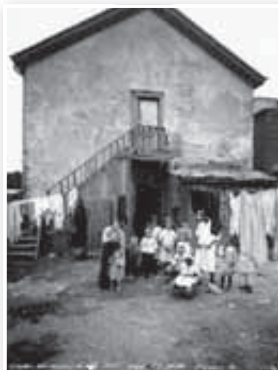
Rear yard, 512 Front Street East, August 1914

Rabies and poliomyelitis emerged as new epidemic threats at the beginning of the decade. A 1910 rabies outbreak in southwestern Ontario spread public alarm,