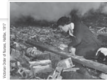
Victorian Order of Nurses, Halifax, 1917

necessary to enforce it.” 48 On February 20, 1919, the Speech from the Throne formally committed the federal government to create a Department of Public Health.