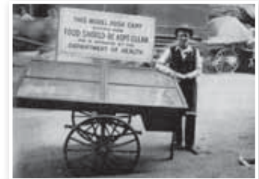
Itinerant push cart and food safety

ventilation," as well as health talks by public health leaders. An elaborate exhibit loaned by the Chicago Health Department portrayed "by means of sleeping dolls and smoke the unhealthy effect of sleeping in a poorly ventilated room." The Canada Lancet said, "We hope that this feature of Toronto's great exhibition may be repeated in future years. Knowledge is power. Nowhere is this power of more value than in the fight with disease." 24