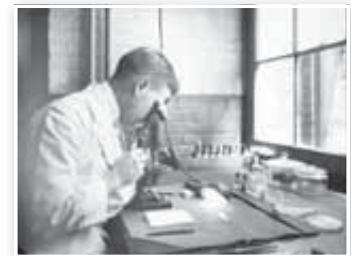
Sancroft Pasteur Limited, Comaught Campus, Archives

that poor sewage control could result in a major outbreak of typhoid. There had been cases of typhoid in the area for several years, but they were largely confined to the poorer areas of the city