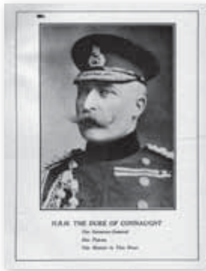
Prince Arthur William Patrick Albert, 1 st Duke of Connaught and Strathearn

Public Health Journal, 5 (September 1914)