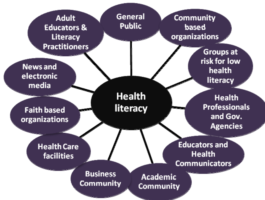
Figure 1. Major stakeholders involved in health literacy

Improved health literacy can contribute to more informed choices, reduced health risks, increased prevention and wellness, better navigation of the health system, improved patient safety, better patient care, fewer inequities in health, and improved quality of life. Health literacy applies to all individuals and all health systems (organizations). To illustrate: