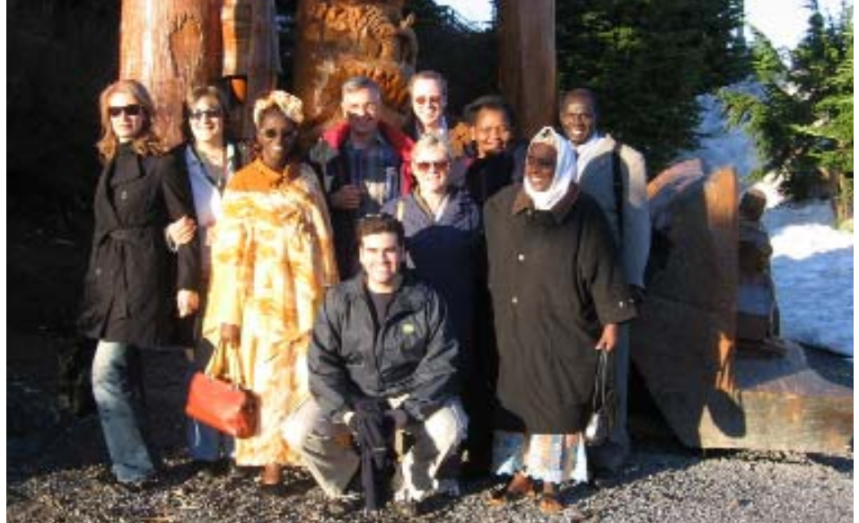
International delegates from the Balkans (Serbian delegates, at far left) and Africa (Congo-Brazzaville, Niger, Mozambique, Uganda) pose with CPHA Global Health Programs staff next to the snow atop Grouse Mountain, near Vancouver.

Two other delegates spoke at a satellite event prior to the CPHA Conference, the Global Health Symposium organized by Simon Fraser University's Faculty of