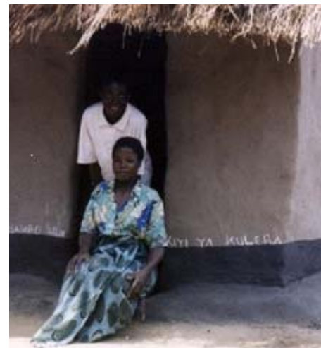
Two members of Mkanda Village Health Committee in front of their house decorated with Reproductive Health messages