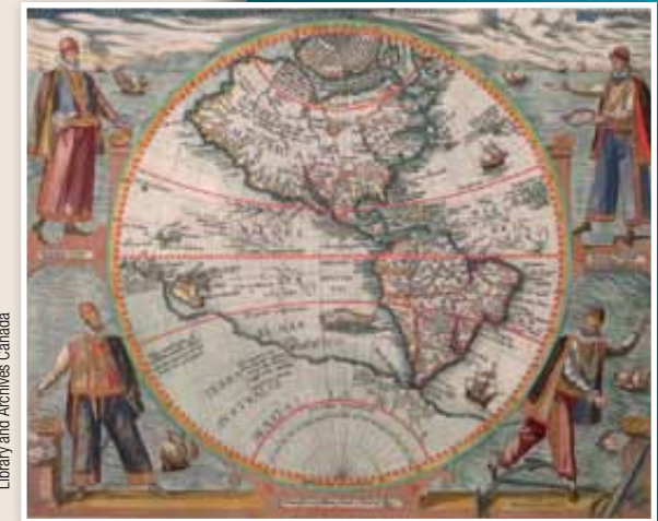
Library and Archives Canada

In Britain, where high rates of infectious diseases and child mortality were linked to the grossly unsanitary conditions and polluted drinking water among the working classes, the sanitary reform movement continued to grow. Britain’s 1848 Public Health Act resulted in more proactive measures to prevent disease and promote health, including the establishment of vital statistics registrars and voluntary public health associations to build support for public health reforms. During a cholera outbreak in London, England in 1854, British physician John Snow discovered that a neighbourhood water pump on Broad Street was the cause of hundreds falling ill and many deaths. Snow’s work followed Edwin Chadwick and other physicians in Britain and New York City, who had undertaken detailed investigations into the sanitary conditions of labourers. Their work was strengthened by the